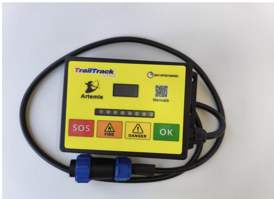
Device 2 has dimensions of 150 × 90 × 45 mm and features slots for securing with cable ties.