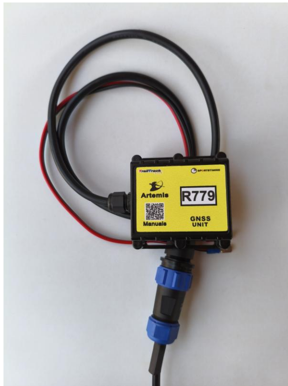
Device 1 has dimensions of 72.5 × 73 × 27.3 mm and features slots for securing with cable ties.